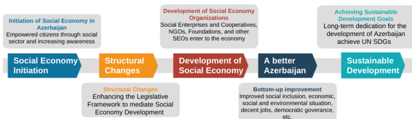
Diagram 2: Development of Social Economy and Achievement of Sustainable Development

The road to attain sustainable development is explained in 5 steps, but there need to be more attentive strategies at each step in order to achieve the goal. It is important to keep in mind that these steps must be taken through the commitments of all three sectors working in partnership, otherwise, it will take too much time for civil society to reach them on its own, due to legislative, financial, operational and other constraints. The present situation in regard to the SE damages the existing development mechanisms of the country and impedes further improvement of the sector. Therefore, the country is in need for experts on the topic to facilitate the following development steps.